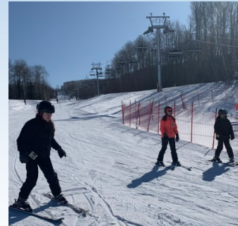
Our Grade 9's had an excellent adventure at Marmot Basin in Jasper.