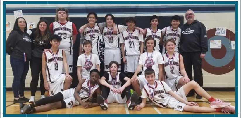
Our Pep Rally was held on March 3rd. Even the Panther made an appearance!