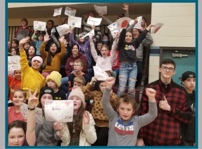
So many students wore green for St. Patrick's Day!